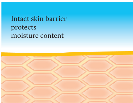
Intact protective skin barrier with lipids rich in linoleic acids

The skin has a natural barrier to prevent excessive moisture loss. This consists of a thin lipid film on the skin and of the structural lipids, rich in linoleic acid , which are situated between the corneocytes connecting them loosely with each other. This forms a structure like a brick wall which denies bacteria and harmful substances a chance to penetrate our skin.